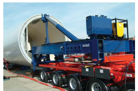
Hydraulically adjustable lift-adapter