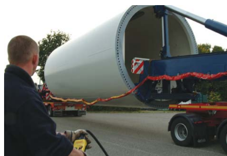
The load can be raised 1.5 metres above the ground