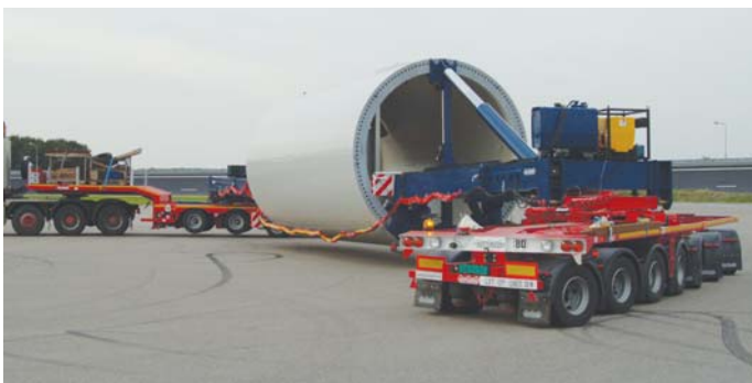
Superior manoeuvrability of the MEGA Wind Turbine transport

The Collett MEGA Wind Turbine Transporter consists of 2 hydraulically adjustable lift-adapters that can be universally employed on various vehicle types.