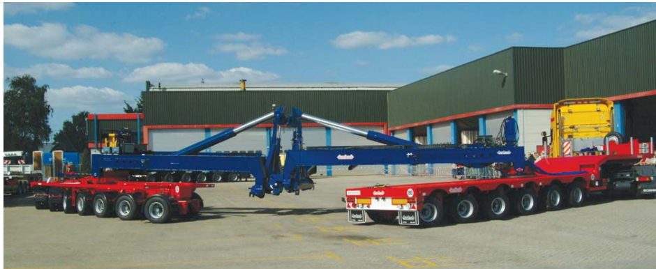
Lift-adapters can easily be connected together for the return journey