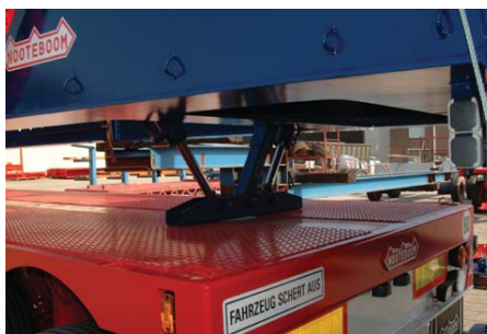
The lift-adapter can easily be moved in any position